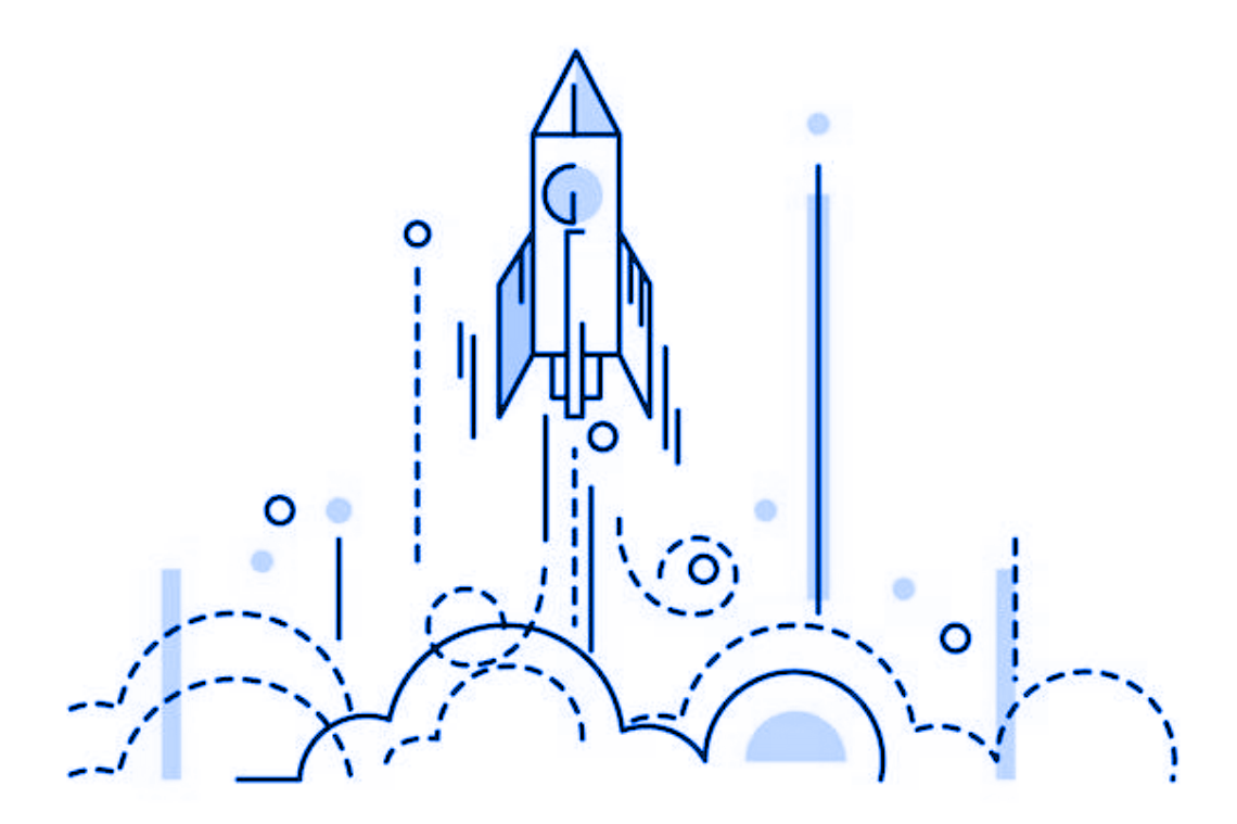
For more information